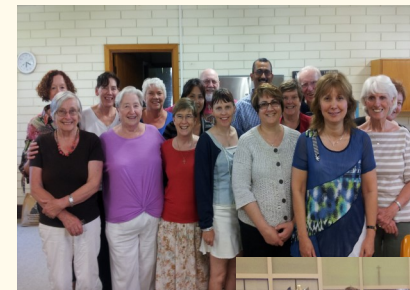
2013 Spiritual Formation Program participants

The ten day centering prayer retreats and the two day live in retreats are held at Largs Bay on the Esplanade. It is a wonderful location with the beach just across the road and offers a peaceful space in which to enter into the silence which enables us to listen deeply to our hearts.